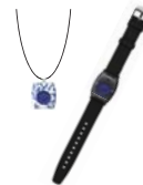
WTRS2 Emergency Pendant & Wrist Transmitter