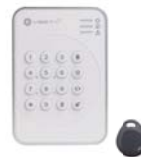
KPT-23-EL-F1 & KPT-23N-EL-F1 Remote Keypad with Tag & NFC Label