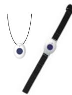
WTRZ Emergency Pendant & Wrist Transmitter