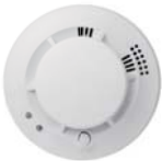
SD-16-F1 Smoke Detector