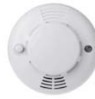
SD-8-F1 Smoke Detector