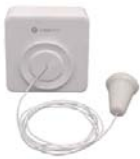
PCU-3-F1 Pull Cord Unit