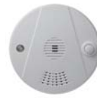
HD-9-F1 Heat Detector