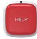
PB-23-F1 Panic Button