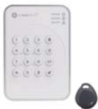
KPT-23-F1 & KPT-23N-F1 Remote Keypad with Tag & NFC Label