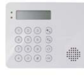
KPT-35-F1 & KPT-35N-F1 Remote Keypad with Tag & NFC Label