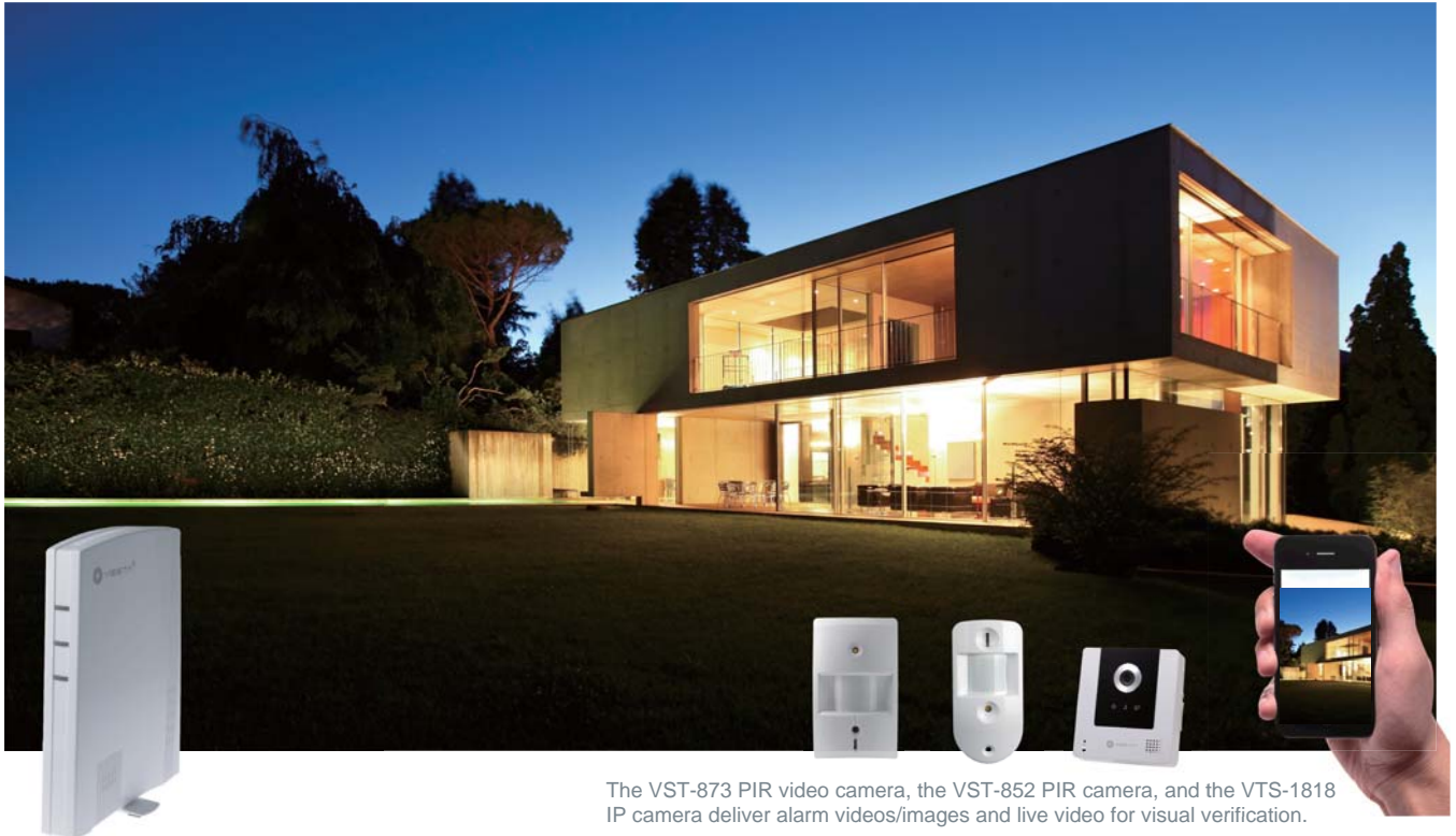
The VST-873 PIR video camera, the VST-852 PIR camera, and the VTS-1818 IP camera deliver alarm videos/images and live video for visual verification.

The 160-zone HPGW-G protects your premises with industry-leading security monitoring and communications technologies.