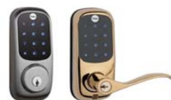
Yale is a registered trademark of Yale Security Inc., an ASSA ABLOY Group company.

The HPGW-G's compatibility with Yale* locks allows users to easily lock or unlock their doors with a simple touch on smartphones. Users don't need to fumble through pockets or purses fishing for keys.