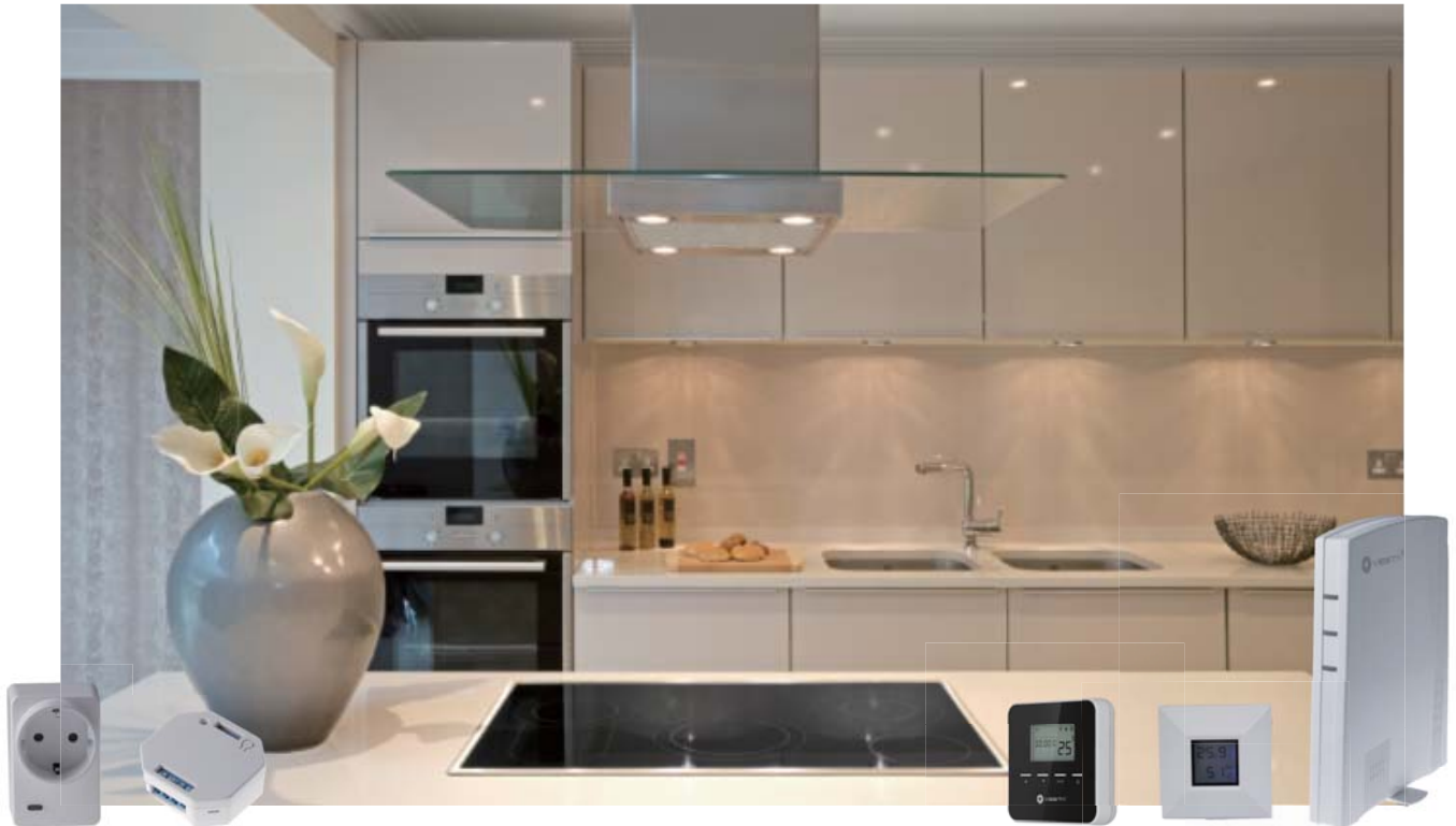
Adopting the ZigBee Pro HA 1.2 standard, the HPGW-G is compatible with ZigBee devices from other manufacturers.

Advanced ZigBee and Z-Wave solutions automate your home and animate your everyday life.