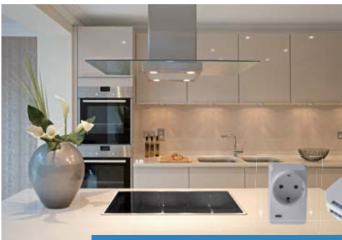
Adopting ZigBee HA 1.2 profile, ML series is compatible with all ZigBee accessories produced by other manufacturers

Home Automation allows homeowners to gain a centralized control over household appliances, lighting system, and digital door locks for enhanced security, comfort, and energy efficiency. ML series panels adopt ZigBee Home Automation 1.2 profile and are compatible with all ZigBee sensors and accessories such as Power Metering Switch, Power Switch, and Dimmer Switch...etc. from other manufacturers under this profile to perform home automation and energy monitoring functions. Various home automation rules and conditions can be controlled and activated according to your needs or preferences. Moreover, ML series works with temperature sensor/room sensor to operate home appliances through temperature control. Heater and air conditioner will be turned on/off automatically when temperature reaches or drops below a pre-set value. This extended service will guarantee to reduce your energy bills while making your home comfortable.