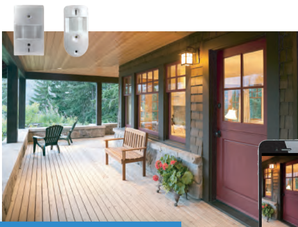
PIR video camera/PIR camera for motion detection and capturing 10-second video clip/ 3 alarm images whenever an alarm is triggered

The MZ system is one of the F1 Security@2km Series' control panels delivering record-breaking 2-km communication range and superb reliability. Its extensive RF coverage allows the installer to set up the alarm system on large or complicated premises with great flexibility. The MZ Series is compatible with the F1 Series of accessories that feature long RF range.