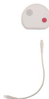
WPC-20 Water Probe Cable 20cm