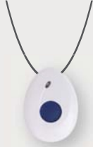
Bluetooth Smart Pendant for Mobile Tracking