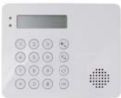
KP-35-F1 Remote Keypad