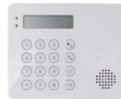
KPT-35-F1 & KPT-35N-F1 Remote Keypad with Tag & NFC Label