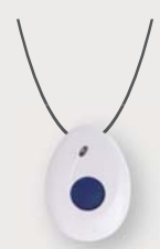
Bluetooth Smart Pendant for Mobile Tracking

*Note: Actual battery life may vary with product settings, usage patterns and operating environment.