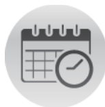
Custom Scenes & Schedules