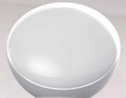
AQS-1 Air Quality Sensor