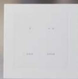
WSS-4E 4-Scenario Switch