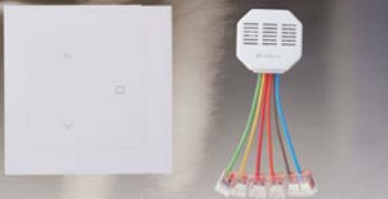
SCM-5 & SCS-1 Shutter Controller & Switch