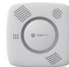
SDCO-1 Carbon Monoxide Detector